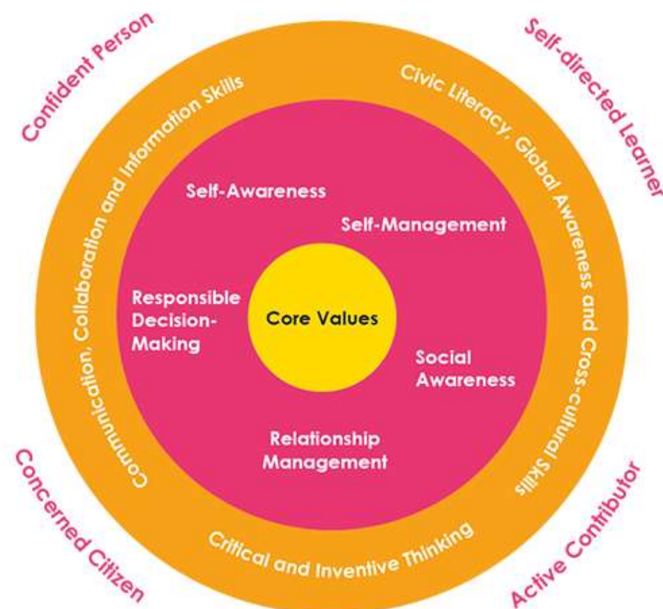
Figure 1: Framework for 21st Century Competencies and Student Desired Outcomes – Singapore Ministry of Education (Copyright ©2014 Ministry of Education, Singapore. All rights reserved)

The Framework developed by the Singapore Ministry of Education ( Fig. 1 ) for outdoor learning is a useful starting point to think about structuring the evidence presented in this report around student competencies and desired outcomes, particularly as the focus on student outcomes is not simply about academic achievements but is driven by an acknowledgement that young people need to have other skills to succeed in an increasingly globalised economy.